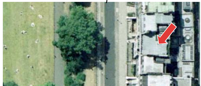
Google Earth satellite image of Sir John Soane's Museum