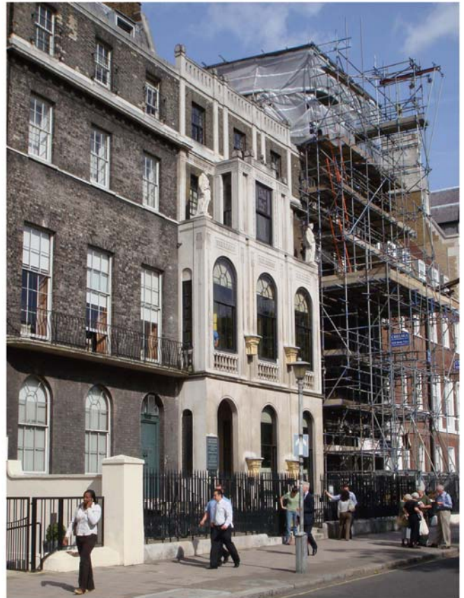
The three Soane houses: No.12, No.13, and under scaffolding, No.14