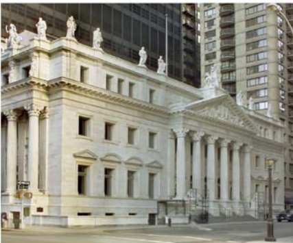
Appellate Division Courthouse of the New York Supreme Court (c.1900-02)

This fall the Soane Seminar examines the historic restoration of buildings and interiors, considering the challenges inherent in preserving the past while bringing systems up to code, providing energy efficient operations, and insuring universal access. Leading architects and experts in the field discuss these themes from the perspective of a recent projects with sessions being held on-site to fully explore the issues.